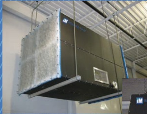
T7500 with filter saver pads

APPLICATIONS: Welding Smoke/Fumes Oil Mist Diesel Smoke Grinding Dust Wood Dust Composite Dust Other Nuisance Dust Vapors